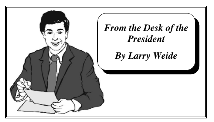
Hello to all,